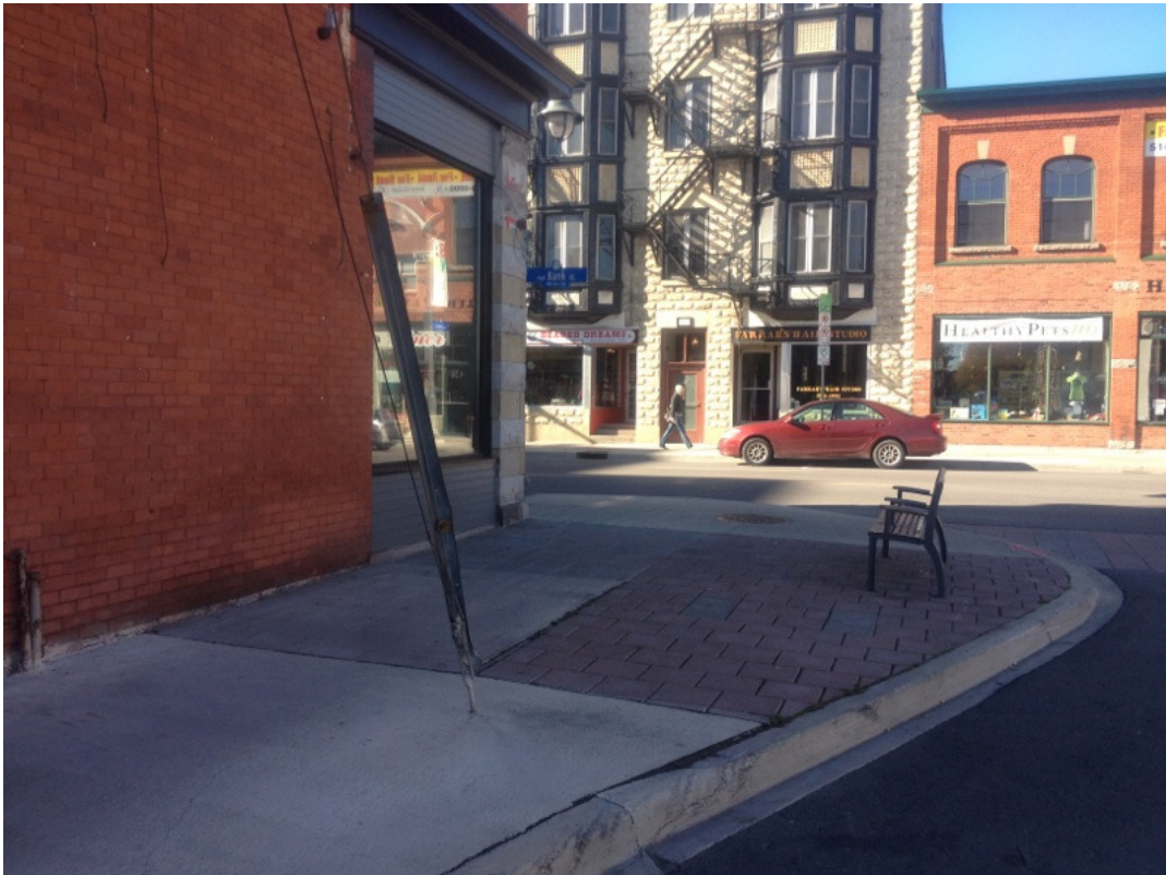
View of Frank Street